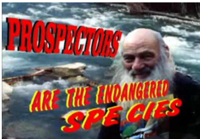
Respect and Protect our Public Lands

http://www.youtube.com/watch?v=Qnil6ubrryw&feature=channel page